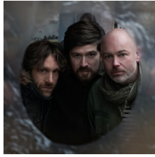
LAU | DECADE (THE BEST OF 2007-2017) FRI 1 DEC 8PM