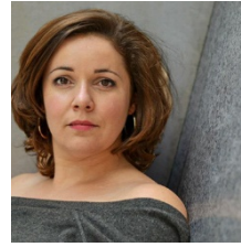
AN ITALIAN BAROQUE CHRISTMAS TUE 19 DEC 8PM