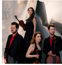
ARMIDA QUARTET SUN 10 DEC 3PM