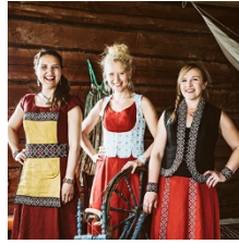
VÄRTTINÄ FRI 8 DEC 8PM