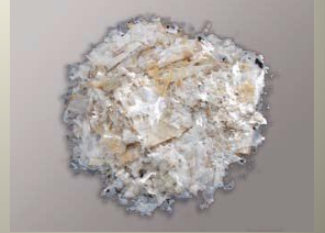
Photodegradable LDPE films after 100 days of direct sunlight exposure