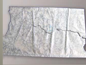
Photodegradable LDPE films after 75 days of direct sunlight Exposure