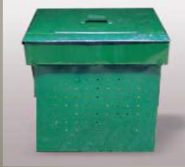
Plastic mobile zero-energy cooler