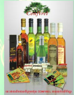
លេខជាតិសម្រាប់អ្នកប្រើប្រាស់ CONFIREL តាមលេខលើផ្ទៃ