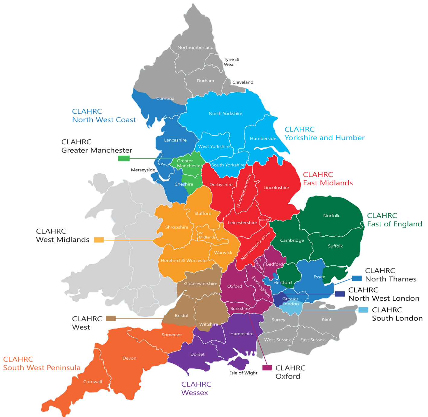
Map produced by NIHR CLAHRC East Midlands*

*Disclaimer - shading is an approximation of a CLAHRC's regional coverage